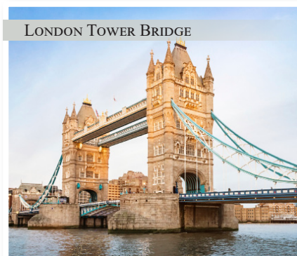
LONDON TOWER BRIDGE

to Trafalgar Square, touring the city from Chelsea to Bloomsbury. The rest of the afternoon and evening are free for you to make your own plans. For those interested, an afternoon visit to the Victoria & Albert Museum or an evening theatre performance can be arranged. (B) OVERNIGHT: LONDON